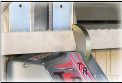
The TPR® hook rotates up to engage the RIG and secure the trailer to the loading dock.