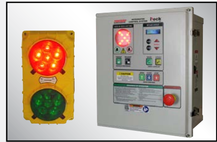
iDock® Controls includes light communication and can be integrated with other dock equipment.